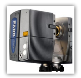
FARO Photon 120