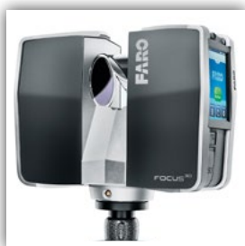
FARO Focus 3D