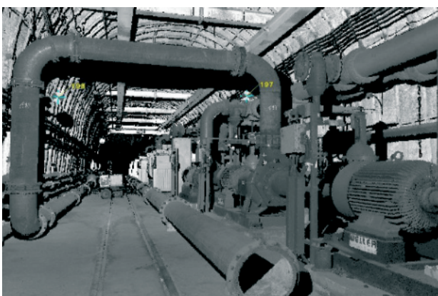
Point cloud of a pumping station

The calibrated scanner can operate in temperatures of 0°C to 40°C.